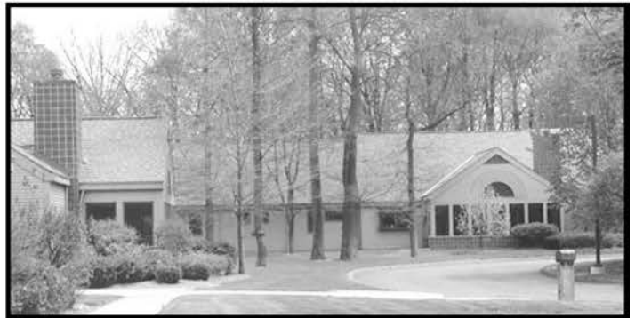
Kimberly Woods residential homes opened in December, 1985. A respite care section opened 3 months later.