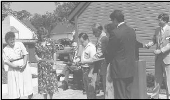
Staff, consumers and board members were on hand for the ribbon cutting at McDowell Road residential homes in August of 1988.