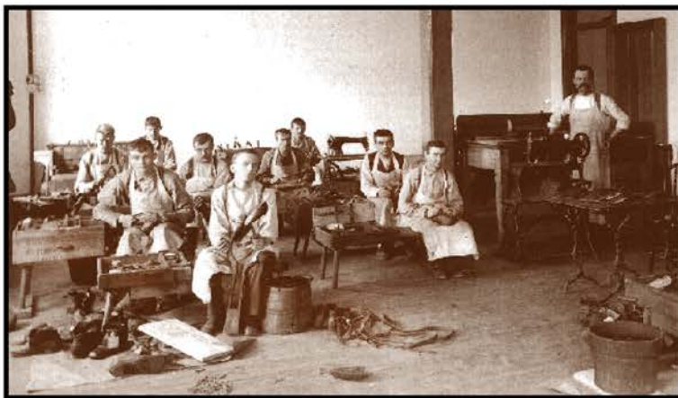
A teacher with his class in the cobbling shop at Columbus State Institute.