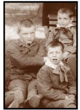
Boys in institutional dress.