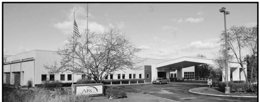
New ARC Industries West at 250 Dodridge Street.