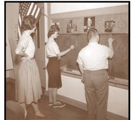
Classroom work was encouraged in the Institutes.