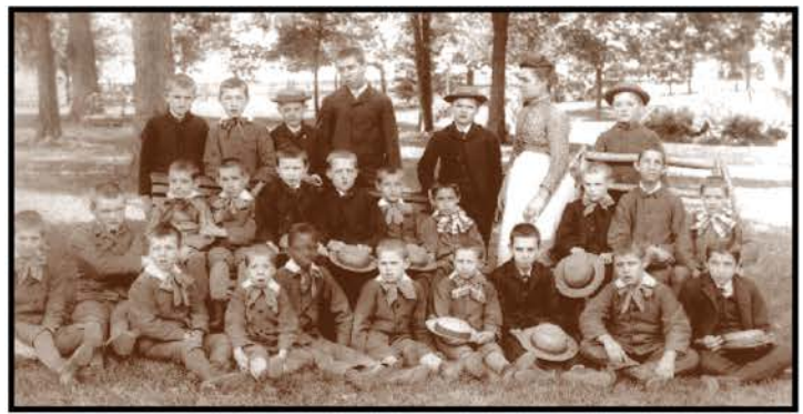
A teacher with her class on the lawn of Columbus State Institute.