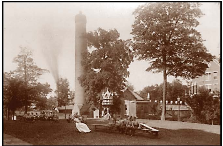
Class out on the lawn at Columbus State Institute.