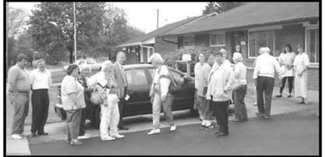
Staff and parents toured the newly opened PACE program.