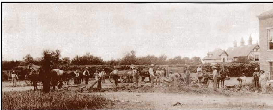
Working in the fields at Orient State Institute.