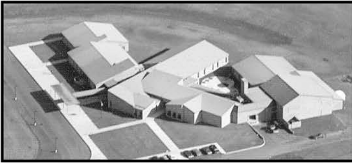
Northeast School before the playgrounds and landscaping were installed.