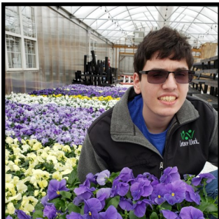
Lettuce Work, a local nursery that provides jobs for young adults with autism, is now open daily.

Lettuce Work Nursery, a nonprofit social enterprise focused on employment opportunities for young adults with autism, is open for the growing season and stocked with Mother's Day flowers.