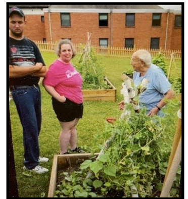
Participants in Goodwill's Adult Day Services program help out in the Gahanna Community Congregational Church garden and get a lesson in growing peas.

Now that the growing season is over, we host our Goodwill partners for games, crafts and other activities. We value our relationship. And as spring comes, we will again move outdoors and work -- together -- in the garden.