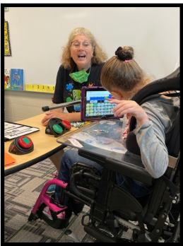
Assistive tech devices can help students communicate with teachers and classmates.