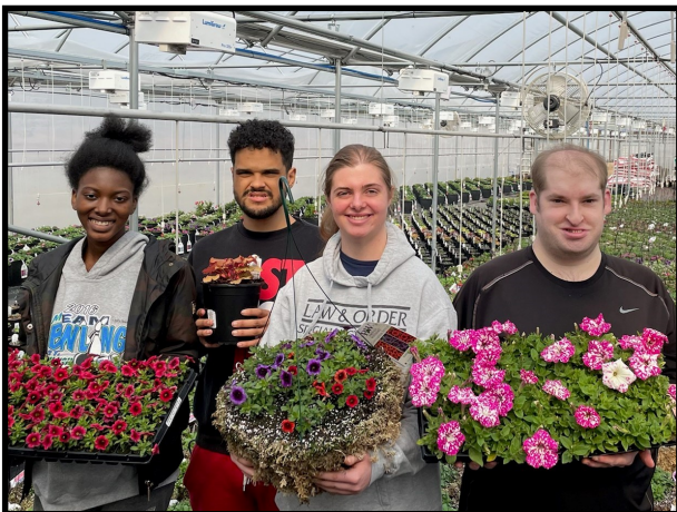
Lettuce Work, a nonprofit nursery open to the public, trains and hires young adults with autism.