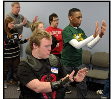
IMPACT Safety hopes to return to in-person sessions, such as the one above, after the pandemic.

For more information or to schedule a workshop, email info@impactsafety.org or call 614-437-2967