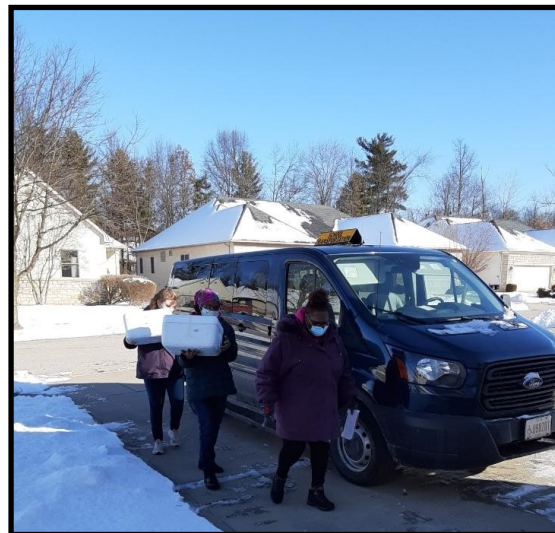
West Central students leave frozen food on porches for Meals-on-Wheels recipients. Hot-meal delivery is paused during the pandemic.