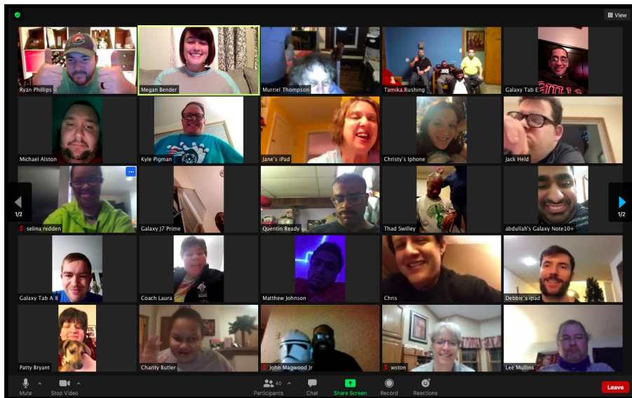
Special Olympics athletes stay in touch and enjoy trivia games on Zoom.