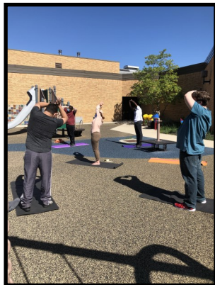
West Central School students learn yoga while observing social/physical distance and utilizing the outdoor learning space.

While at school, teachers and therapists will schedule and utilize school spaces such as gymnasiums, outdoor learning areas, art rooms and other areas to help maintain social/physical distancing wherever possible. Where possible and appropriate, face coverings are worn by students. All staff wear face coverings when with students.