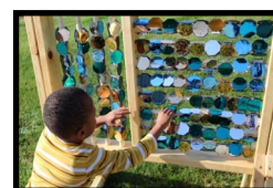
ECE students can be found doing many activities in various outdoor learning spaces.