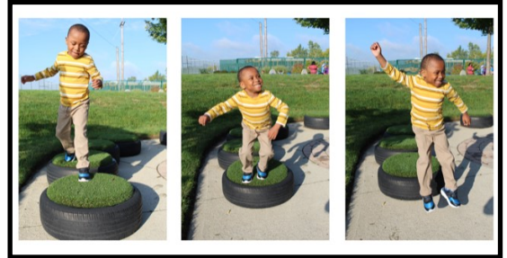
Children enrolled in our Early Childhood Education program spend extra time utilizing outdoor learning environments!

Beginning with Transportation, Bus Drivers or Assistants take the temperature of all students before they board the bus. Then seats are assigned to maintain as much social/physical distance as possible. Bus staff wear face coverings and Transportation staff have regular protocols to sanitize the buses after each trip with electrostatic mist sprayers.