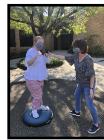
West Central School students use the outdoor learning space to make buckeye necklaces and do their physical therapy.