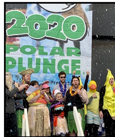
Franklin County Flyers Special Olympics Group won Best Costume.