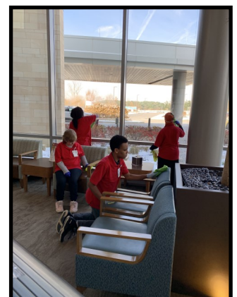
Project Life students participate in internships at Mt. Carmel Hospital.