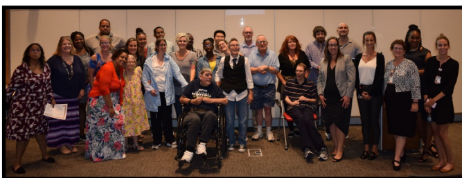
Congratulations to the 2019 PIECE Project participants, volunteers and support staff for another successful year.

Work sites for the summer program included the Columbus Zoo, COSI, Dodge and Thompson Recreation Centers, RenTek and numerous sites on The Ohio State University campus. Participants stocked shelves, greeted people, cleaned, provided clerical support and any number of other tasks to demonstrate skills and better 'discover' their true interests for future employment opportunities.