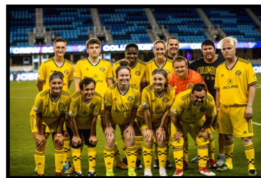
Franklin County Special Olympics Unified Soccer Team in San Jose.

For more information on Franklin County Special Olympics, go to www.facebook.com/FranklinCoSpecialOlympics or call 614-342-5989.