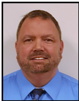
FCBDD MUI Department, Investigative Agent Coordinator

Investigative Agents must be certified through the Ohio Department of Developmental Disabilities (DODD) which means completing the basic, state required training and then maintaining the credential through periodic in-service updates. Further, staff voluntarily complete course work at the Ohio Peace Officers Training Academy in report writing and interview techniques. They are seasoned, dedicated professionals and most have been doing this work for more than fifteen years.