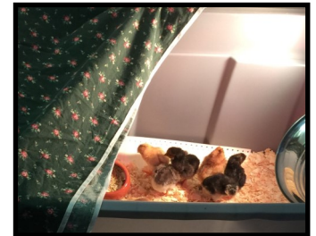
Some pictures from the ECLC Art Show help to demonstrate the fun.