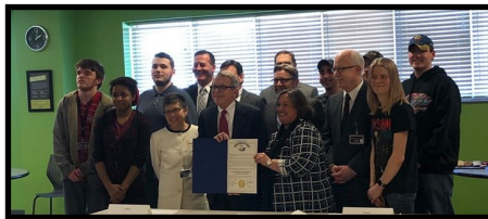
Governor DeWine presents a proclamation to Project Search partners and participants at Designer Brands Warehouse (formerly DSW).