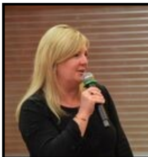
Senator Stephanie Kunze, one of three Senators representing Franklin County, greets the self-advocates.