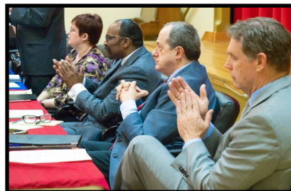
Legislators and State Officials listened to comments from the audience.