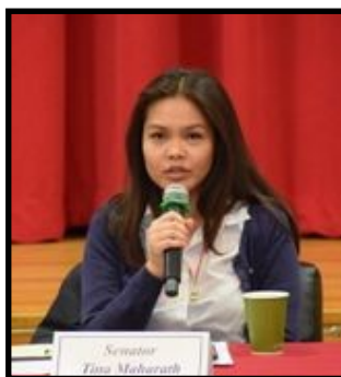
Senator Tina Maharath, from Franklin County, wants to prioritize issues to take back to legislature.