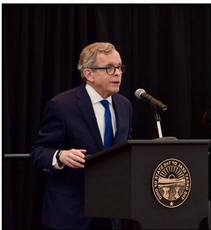
Governor Mike DeWine speaks at DD Awareness Day.