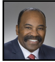
Senator Hearcel Craig