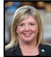
Senator Stephanie Kunze