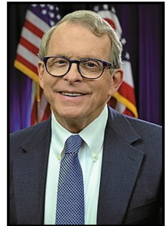
Governor Mike DeWine

Governor DeWine signed this and five other Executive Orders on his first day in office on January 14, 2019.