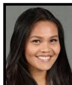
Senator Tina Maharath

Congratulations to recently elected Senator Tina Maharath. Senator Maharath will represent District 3.