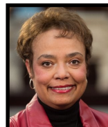
Senator Charleta Tavares