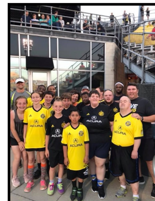
Franklin County Special Olympics athletes played an exhibition soccer game during halftime of the Crew SC vs. Toronto FC match at MAPFRE Stadium on June 2nd.