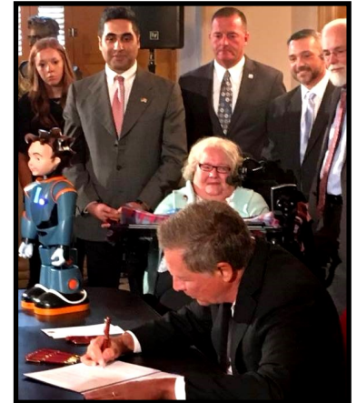
Governor Kasich signs Technology First Executive Order