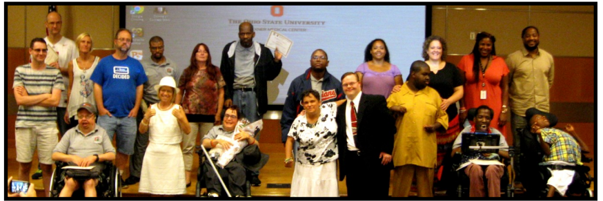
PIECE Project participants attend the closing ceremony of the 2016 PIECE Project.

This year's project featured a wide variety of internships at sites all around the OSU Campus such as The Fisher College of Business, The Department of Art Advising Office, Atwell Hall and The Nisonger Center, the OSU RPAC (Recreation and Physical Activity Center) and the Schoenbaum Family Center kitchen and library as well as off campus partners Community Computer Alliance and Straders Garden Center. People arrived on campus in cabs, vans and cars and got a great feel for employment in the community as well as a good dose of campus fun on tours, eating lunch and playing basketball at the Recreation and Physical Activity Center.