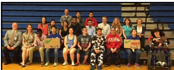
Participants in the first ever Transition After School Program.