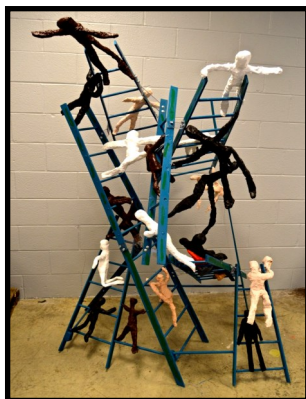
'The Ladder of Hopes and Dreams'.

Congratulations to Sunapple Artists, located at ARC Industries West on another winning art installation.