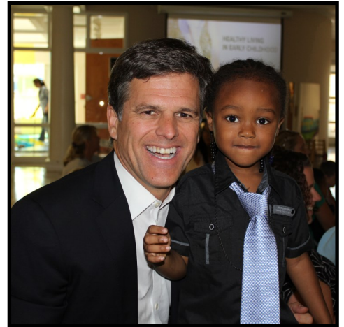
Timothy Shriver shares tie with Emory.