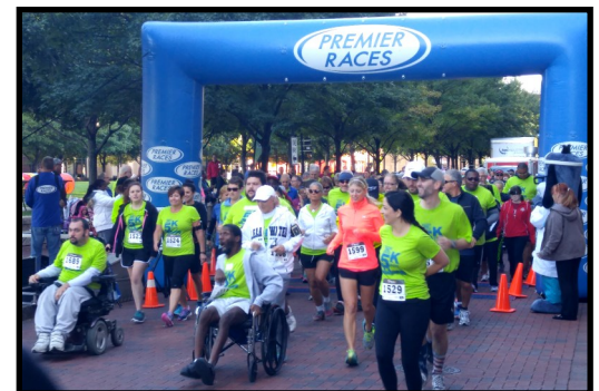
Rollers, walkers, runners at the 5K starting line.