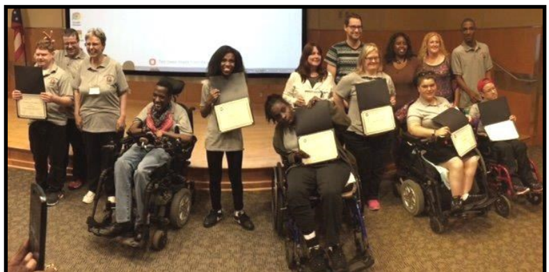
PIECE participants proudly show their completion certificates.