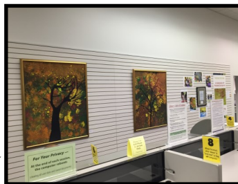
Artists from Hague display their artwork at Grandview Heights Public Library.

Congratulations to artists from the Hague Living Skills Center for their participation with the colorful paintings on exhibit at the Grandview Heights Public Library .