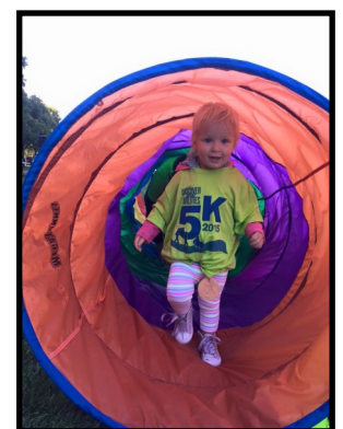
Fun activities for all ages.