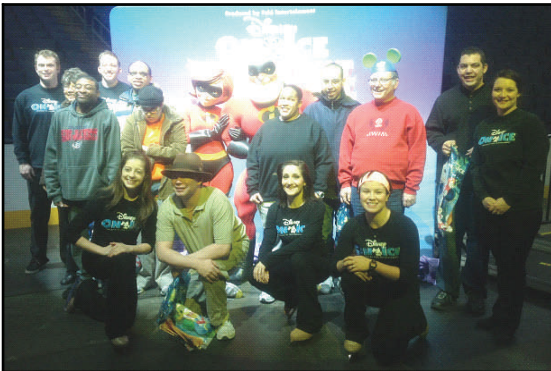
Franklin County Special Olympics ice skaters visit Disney on Ice