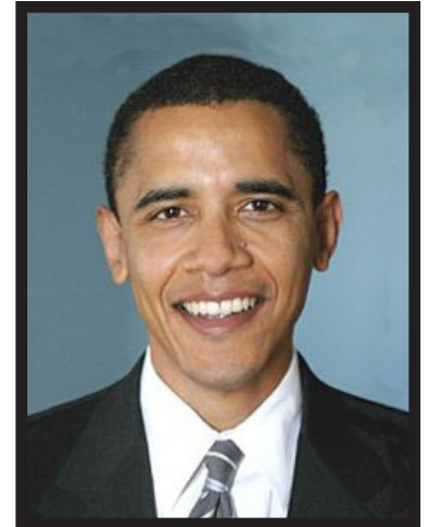
Senator Barack Obama

The Ohio Disability Vote Coalition provided signs to remind people to register to vote. For details, please contact the coalition at 866/ 575-8055.