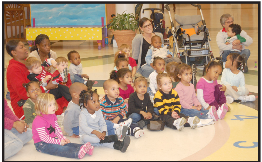
These YMCA Toddler Classes were among the first to hear the story of the Hiccupotamus.