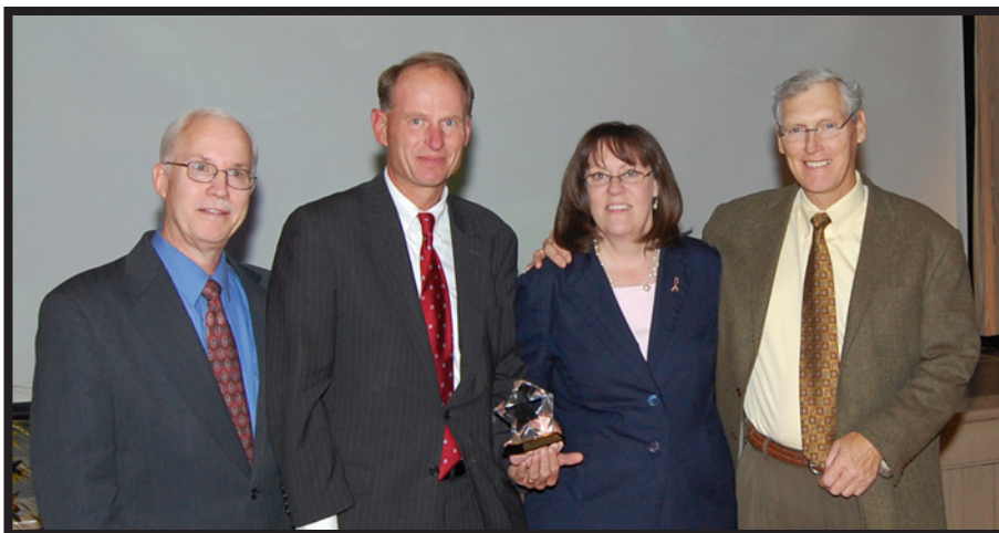
United Cerebral Palsy was honored as the Provider Organization.