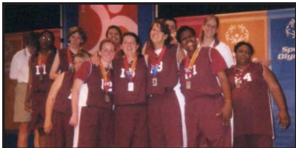
The women's basketball team captured a silver medal.