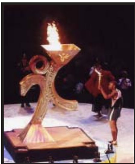
The traditional lighting of the torch during opening ceremonies. Let the games begin!