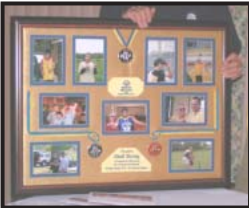
The Smith Barney award.