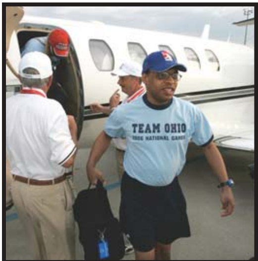
Athlete Eddie Robinson gets off the plane in Iowa. Eddie won 3 gold medals, 1 silver medal, and 2 bronze medals in gymnastics.