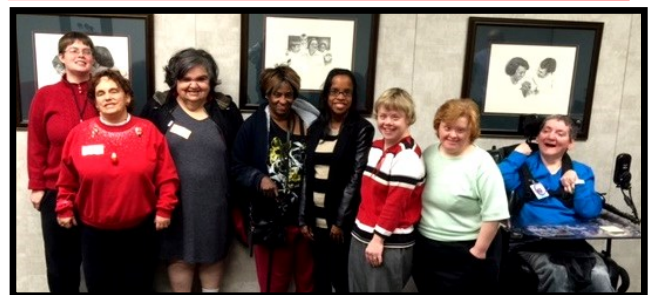
FCBDD 2016 Self Advocacy Advisory Council

The Franklin County Convention Facilities Authority commissioned Sunapple Studios to sketch and mold into clay their interpretation of several landmark Columbus buildings and the art is now displayed at the Vine street garage.