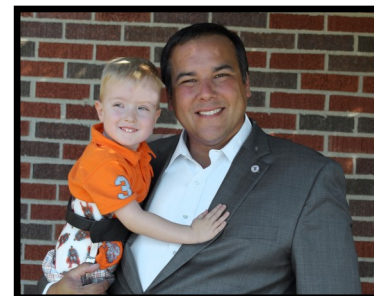
Mayor Ginther visits the Early Childhood Education and Family Center.