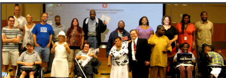
2016 PIECE Project participants partnering with The Ohio State University.