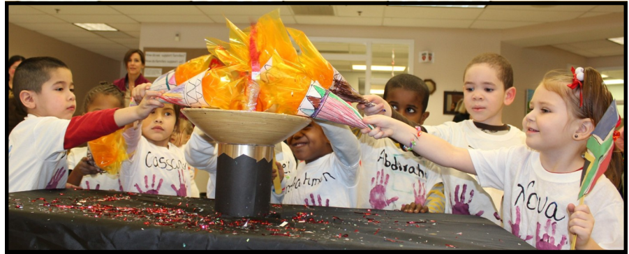
Lighting the Olympic flame at the opening ceremony.

The overlap between the Early Childhood games and the televised Olympics in Sochi reportedly resulted in a surprising question by one child to his mother. "How did they know we were having the Olympics at our school?"