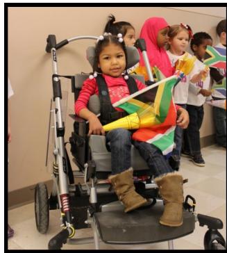
The most important thing is not winning but taking part.