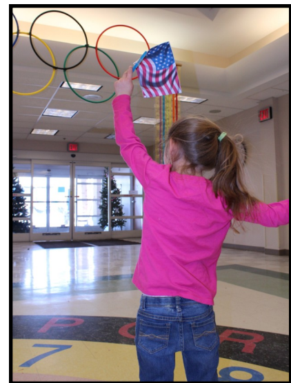
Go U.S.A. !!!