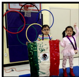
The parade of nations included Mexico.