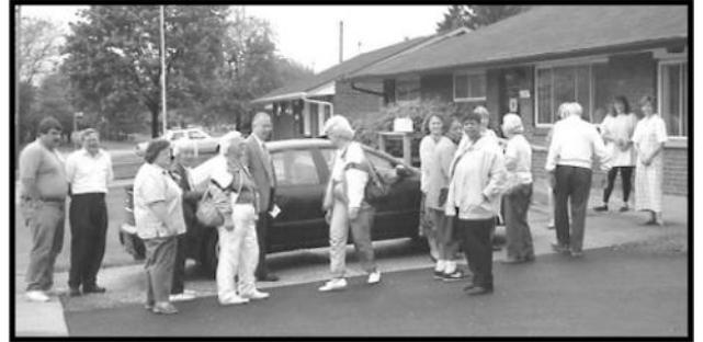
Staff and parents toured the newly opened PACE program.