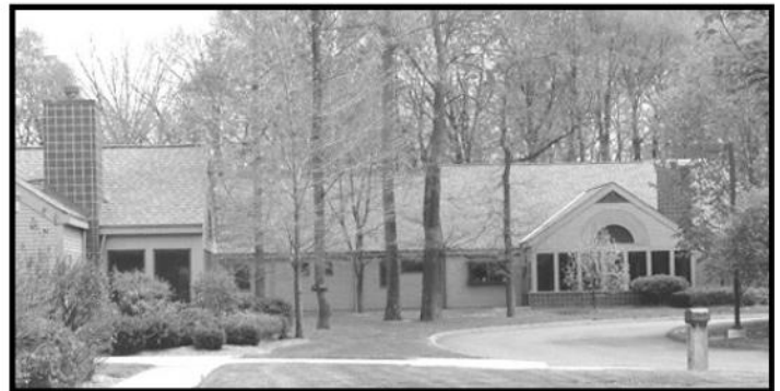
Kimberly Woods residential homes opened in December, 1985. A respite care section opened 3 months later.