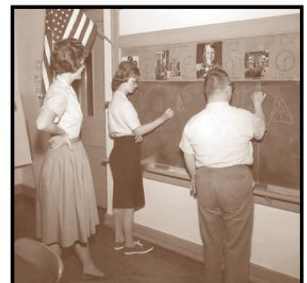
Classroom work was encouraged in the Institutes.