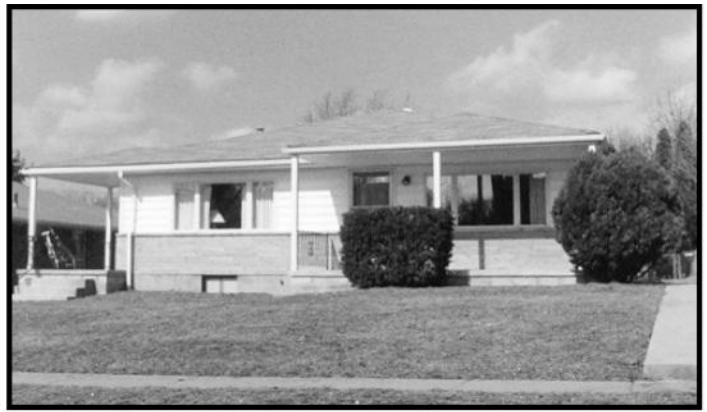
The Highfield Drive, twin-single home, purchased as the first residence for FCRS.