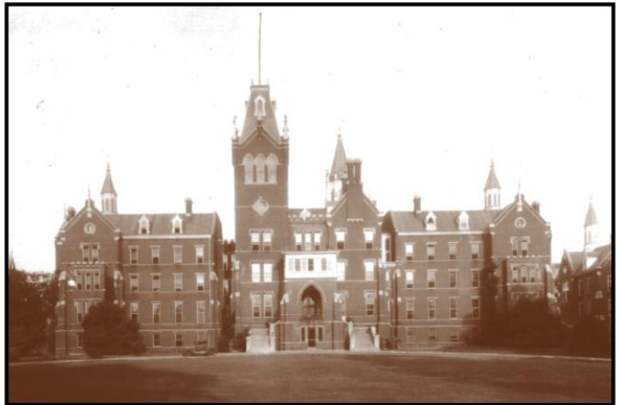
Columbus State Institute as it appeared at the turn of the century.