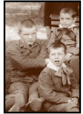
Boys in institutional dress.