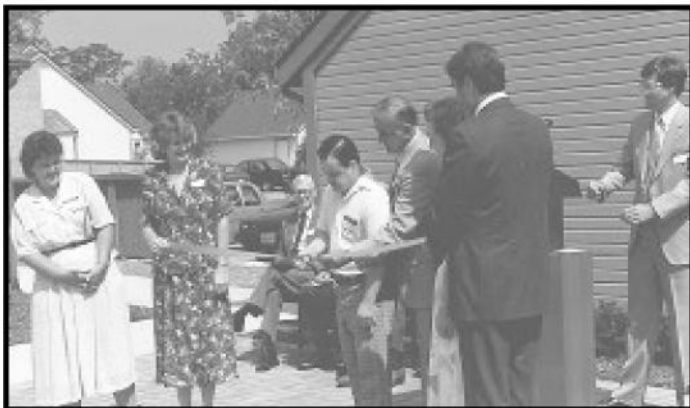
Staff, consumers and board members were on hand for the ribbon cutting at McDowell Road residential homes in August of 1988.