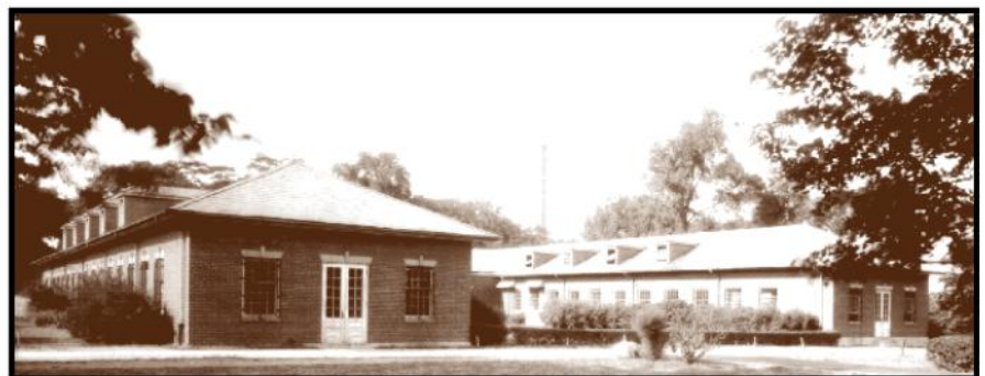
Work buildings on the grounds of Columbus State Institute were converted from dormitory cottages.