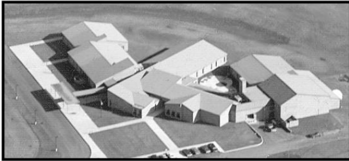
Northeast School before the playgrounds and landscaping were installed.