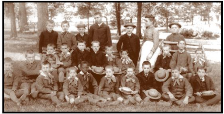
A teacher with her class on the lawn of Columbus State Institute.