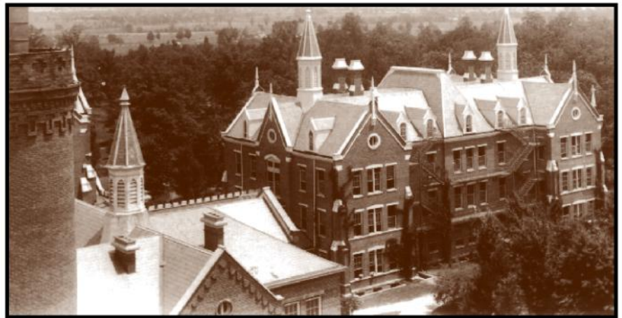
In 1925 there were 89 private institutions, compared to 9 in 1893. There were special classes in 171 cities in the U. S. with enrollment of nearly 34,000.