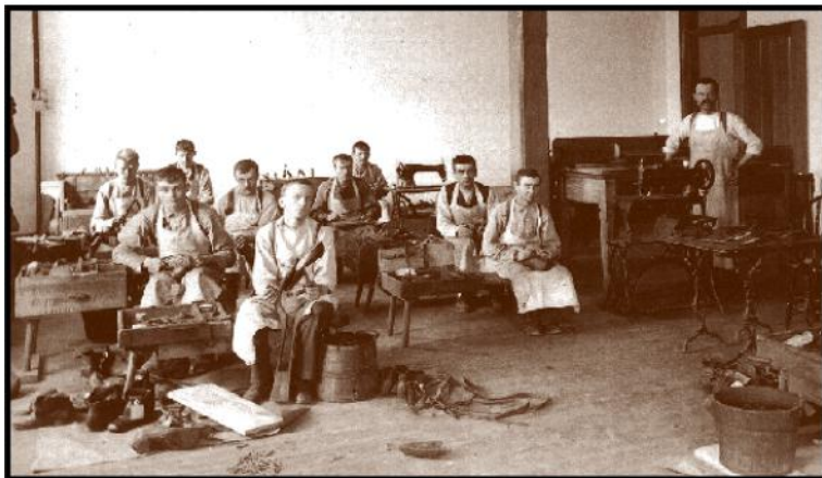
A teacher with his class in the cobbler's shop at Columbus State Institute.