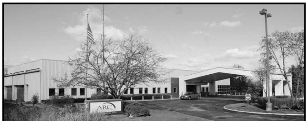
New ARC Industries West at 250 Dodridge Street.