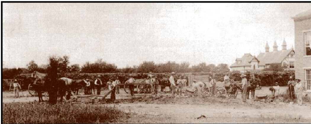
Working in the fields at Orient State Institute.