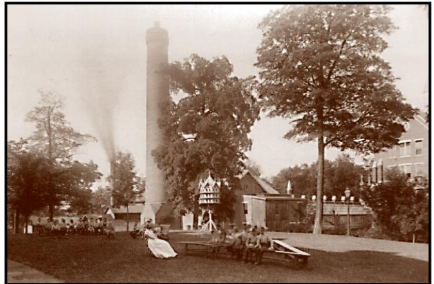
Class out on the lawn at Columbus State Institute.